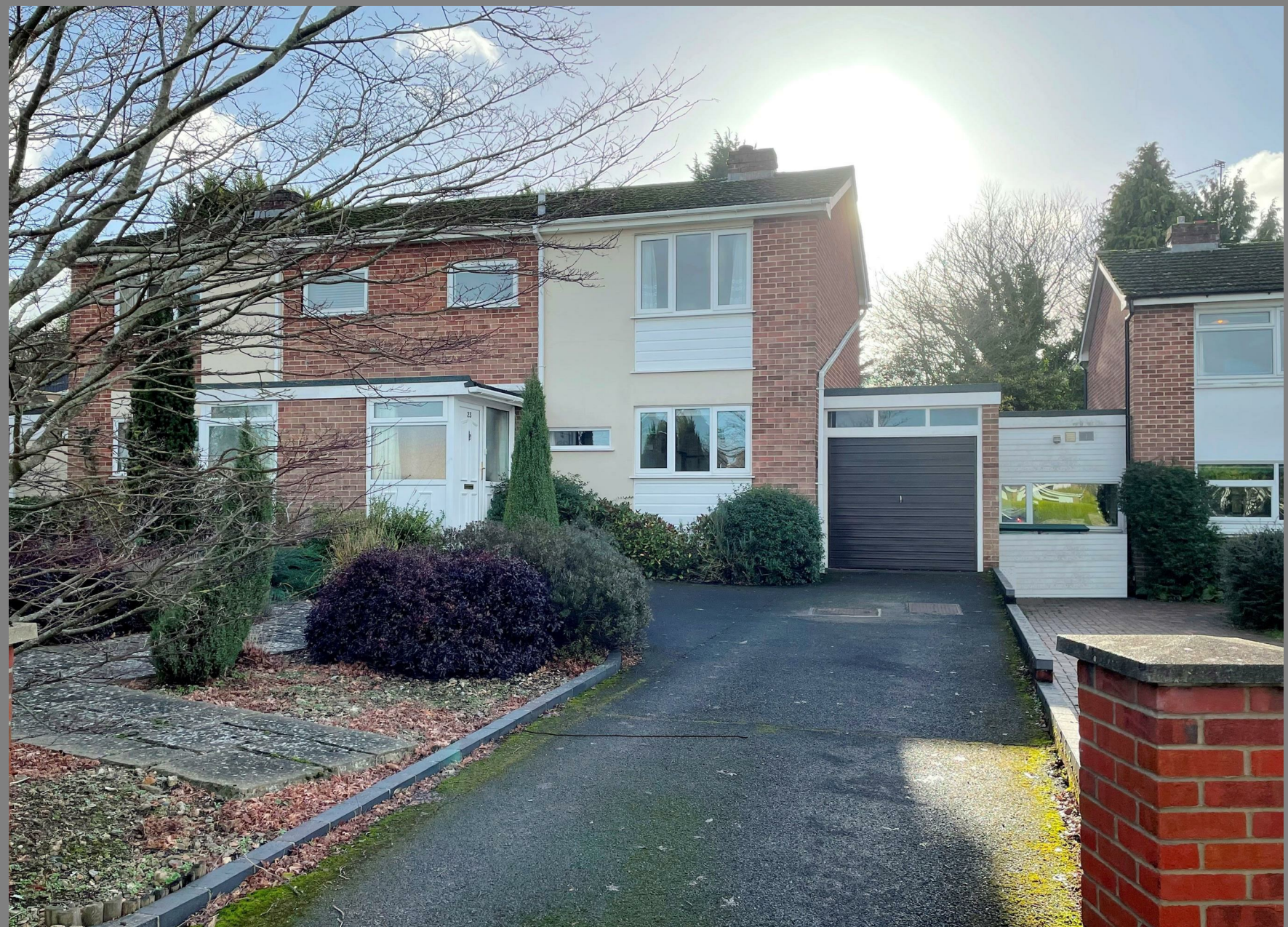
Abbey Close, Newbury